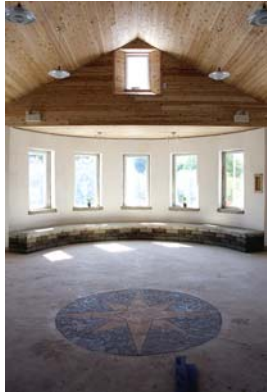
Special touches inside the Camp Kawartha Environment Centre