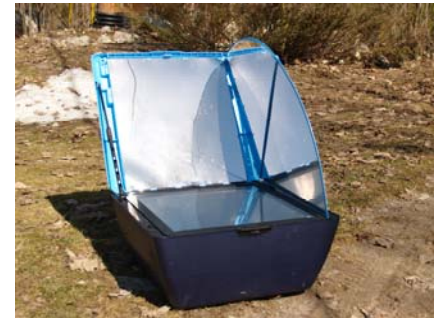
Cooking with the Sun. New acquisitions. Above, a solar oven...below a solar BBQ

At Camp Kawartha we are showcasing different forms of alternative energy. Thanks to a grant from the Ministry of Energy’s Community Conservation Initiatives Program , we have recently purchased a solar oven, solar cooker and installed a unique glycol solar heating system on our office. Phase two involves fund-