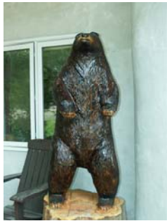
Our New 6 foot High Wooden Friend