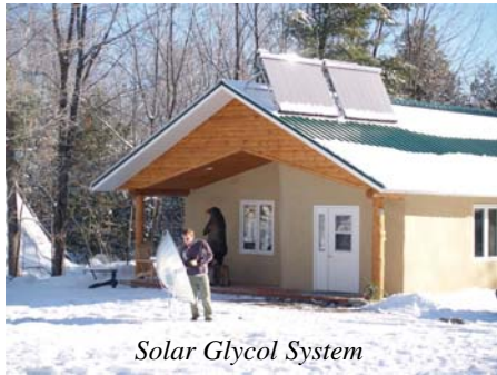
Solar Glycol System

Scientists believe erratic weather is caused by the tons of carbon released into the atmosphere each year by human activity through the burning of fossil fuels (such as natural gas oil and coal), solid waste, trees and wood products, and also as a result of other chemical reactions (e.g., manufacture of cement). Atmospheric Carbon Dioxide has risen from around 300 ppm (parts per million) in 1960 to