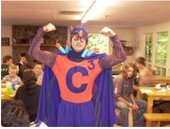
Cool Captain Climate teaches about climate change

Newsletter from Camp Kawartha & The Kawartha Outdoor Education Centre